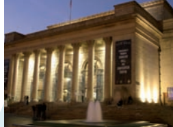
Sheffield City Hall*