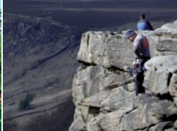
Peak District-Stanage Rocks*