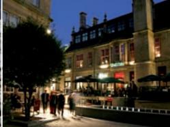
Sheffield by night