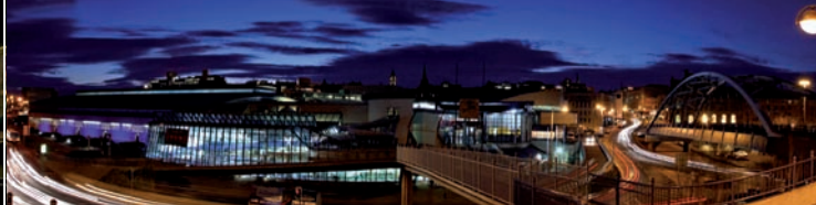
Sheffield by night*