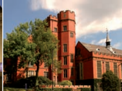
The University of Sheffield