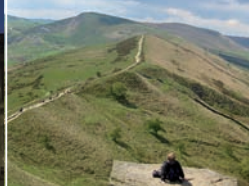
Peak District-Mam Tor